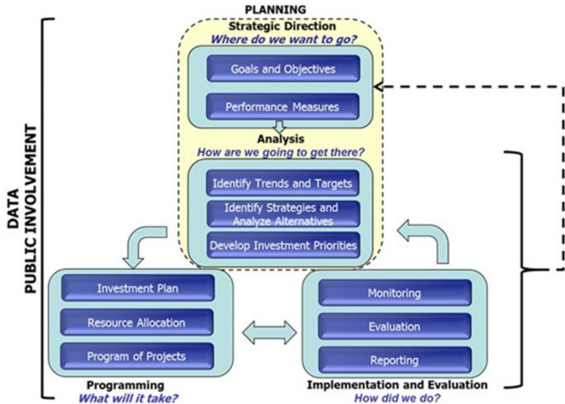
Flow chart describing the process for Performance Management, provided by the National Highway Institute

As a federal requirement, states will invest resources in projects to achieve individual targets that make collective progress toward national goals. MPOs are also responsible for developing LRTPs and TIPs through a performance-driven, outcome-based approach to planning.